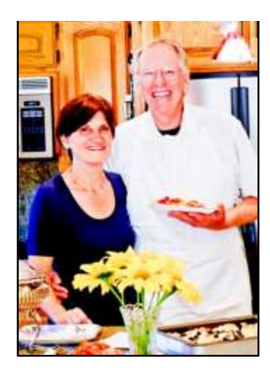
Good Wine, Good Food, Good Friends, CHEERS!