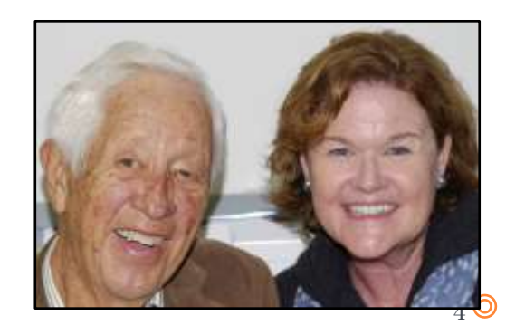
I can't stop telling everyone how much I love the Village!